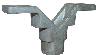
V-Head Pipe Support