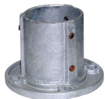
Pipe Stand Flange