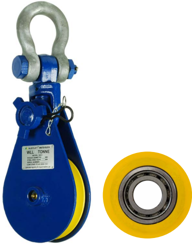
Ball Bearing equipped