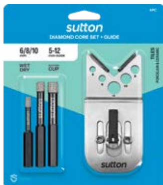
D618 S 4B