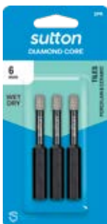
D618 T 0600