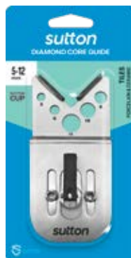
D618 X 001