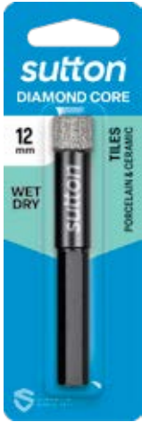
D618 H 1200